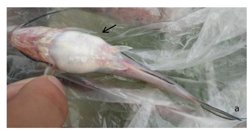
Figure 2. Pathological symptoms of the farmed channel catfish suffering from enteritis: (a) arrow shows abdominal distension; (b) arrow shows intestinal hyperaemia.

Isolate HT2 was virulent to channel catfish with a LD_{50} value of 1.18 \times 10^6 CFU/mL (Table 2). The infected fish exhibited signs of enteritis similar to those seen in the originally diseased fish (Figure 2). When fish were injected with a concentration of 3.2 \times 10^7 CFU/mL, high mortality was observed. Isolate HT2 could be re-isolated from experimentally morbid fish. No clinical signs or mortality were noted in the control fish.